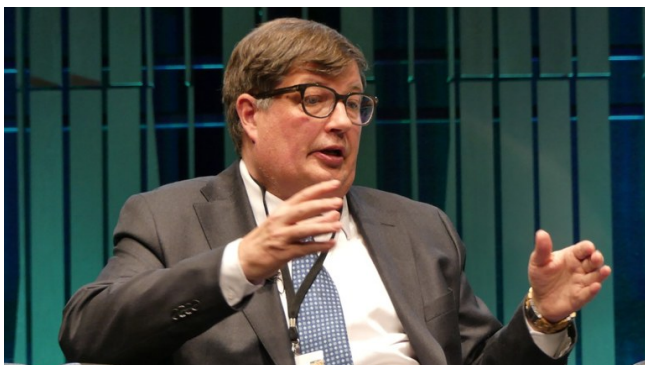
Finland's Minister of Employment Arto Satonen.

“But I believe that training people is the least of our problems. The labour shortage is a much bigger challenge, at least in Finland,” said Vieltojärvi.