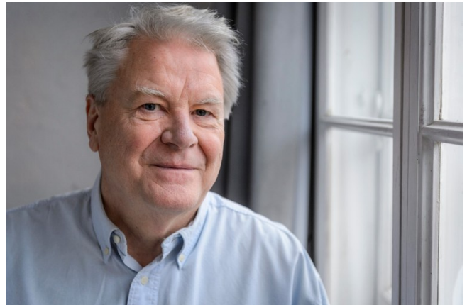
Anders Kjellberg.

The background was decades of unrest in the labour market with many and sometimes lengthy strikes and lockouts. Until the early 1930s, Sweden had more strike days than any other European country.