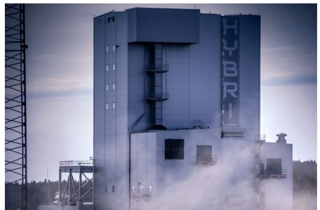
Hybrit's pilot plant in Luleå.

H2 Green Steel are not the only Swedish company wanting to produce fossil-free steel. The competitor is called Hybrit, an acronym for Hydrogen Breakthrough Ironmaking Technology. The owners are the steel company SSAB, the mining company LKAB and the energy giant Vattenfall.