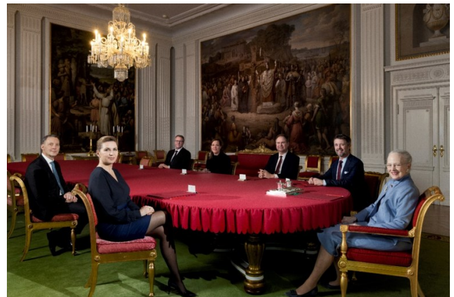
Queen Margrethe in government council.