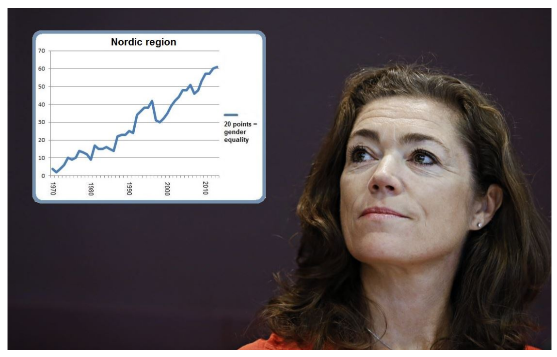
Kristin Skogen Lund, Norway, became President of the Confederation of Norwegian Enterprise (NHO) on 1 November 2012. The diagram shows women in the Nordic region have reached 61 percentage points. 100 points would be full equality on our barometer