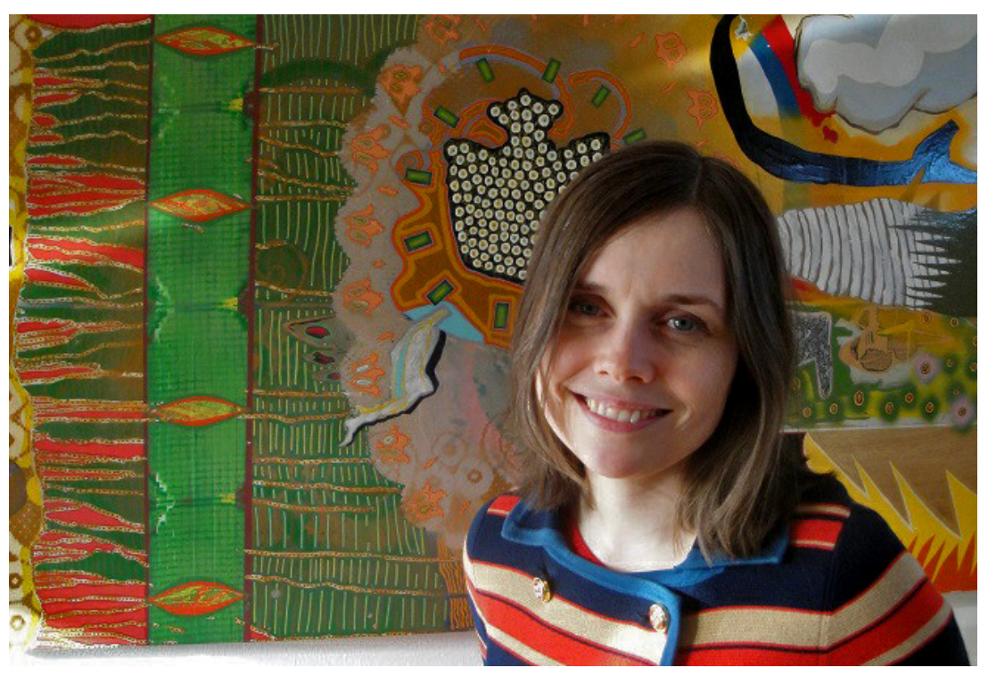
The Minister of Education and Culture Katrín Jakobsdóttir has just been elected party leader for Iceland's Left-Green Movement (VG)