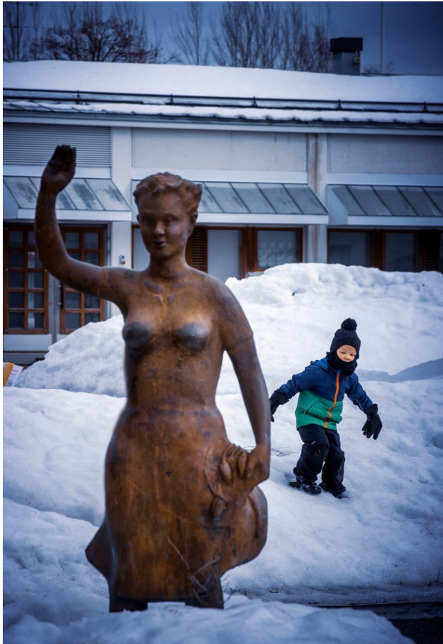
In the Parikkala main square stands a sculpture called Parikkala Pikkupiika (The little maid from Parikkala).