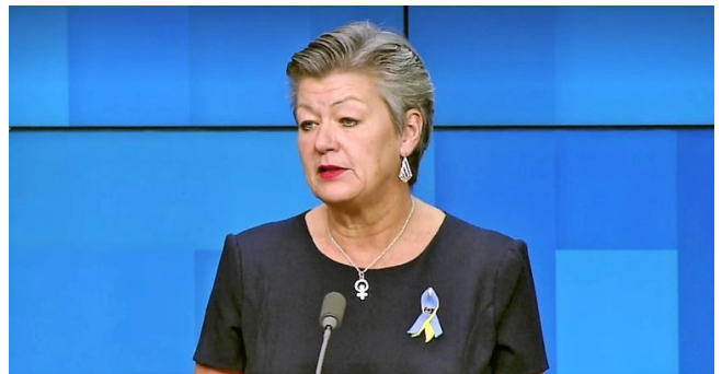
Ylva Johansson addresses the EU Parliament during the debate on the Ukrainian refugee crisis.

As the European Parliament gathered in Strasbourg on 7 March, the war was on everyone's lips. The Ukrainian flag was flying next to EU flags and MEPs were expressing shock and upset as well as pride over a unified EU ready for action. Commissioner for Home Affairs Ylva Johansson was also present after visiting the Polish border to witness the flow of refugees during the first week of the war.