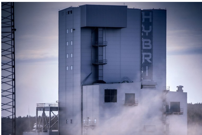
Hybrit's pilot plant in Luleå.

H2 Green Steel are not the only Swedish company wanting to produce fossil-free steel. The competitor is called Hybrit, an acronym for Hydrogen Breakthrough Ironmaking Technology. The owners are the steel company SSAB, the mining company LKAB and the energy giant Vattenfall.