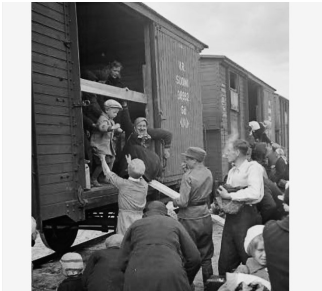
Evacuees from Parikkala in Karelia arrive by train in Vilpula in June 1941.

The small rural municipality of Parikkala is in the southern part of Finnish Karelia. The closest larger cities are Lappeenranta and Savonlinna. To the east, you can see Russia. The so-called Winter War started with the Soviet Union's attack on Finland in 1939. It ended with Finland being forced to cede large landmasses, including Vyborg and several other municipalities.